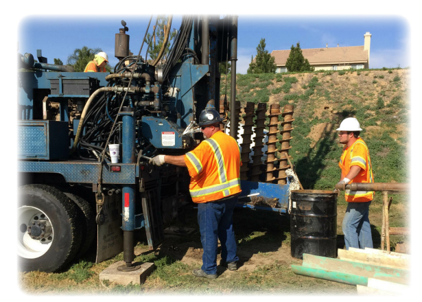
PBHSP PB-4 Well Drilling

Reviewed and revised the draft Adaptive Management Plan.