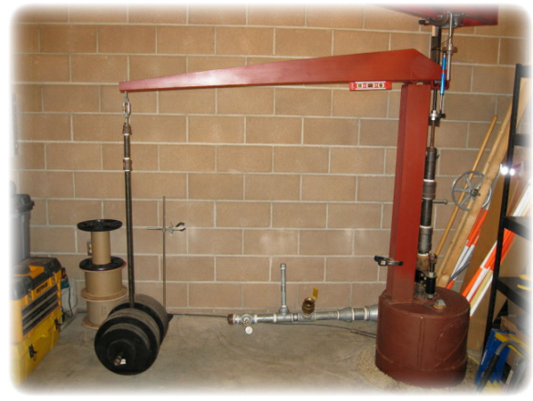
Land Subsidence Monitoring Equipment

Pursuant to the MZ-1 Plan, Watermaster staff and consultants analyzed the data generated from the Ground-Level Monitoring Program through 2014 and the data, results, and conclusions were incorporated into the 2014 Annual Report of the Ground-Level Monitoring Committee (GLMC).