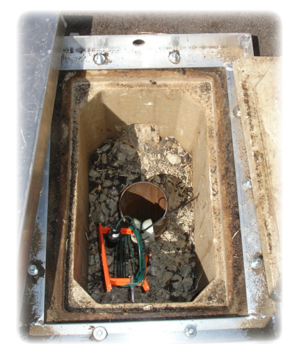
Monitoring Well with a Transducer

The current groundwater-level monitoring program is comprised of about 1,180 wells. At about 950 of these wells, water levels are measured by well owners, which include municipal water agencies, the California Department of Toxic Substances Control (DTSC), the Counties, and various private consulting firms. Watermaster collects these water level data at least